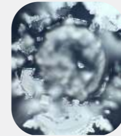
Water molecule before structuring with WMT™

ANTIBACTERIAL CERAMIC BALLS The antibacterial ceramic balls prevent the growth of microorganisms that acts as antibacterial and antiseptic property of the filter.