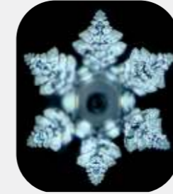
Miracle Water of Life after WMT™ structuring Hado Crystallised formation taken at Emoto Lab in Tokyo, Japan